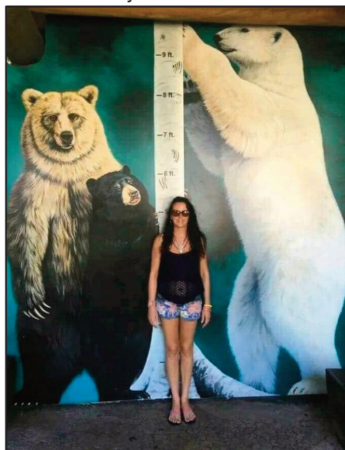
Size chart showing how darn big bears are! Canada is home to the three main bear species as well as some of the rarer breeds. And bears can be found in all parts of Canada!

COMMONYM ANSWERS: 1. they are caught 2. they are tossed 3. they are popped 4. they have caps 5. they have tongues 6. they have anchors 7. they are magazines 8. they have lanes 9. they lift 10. they have checks 11. they have waves 12. they are hitched 13. they are balanced 14. they have tanks 15. they have scores 16. they have bowls 17. they are filled 18. they have picks 19. they are bucks 20. they deliver